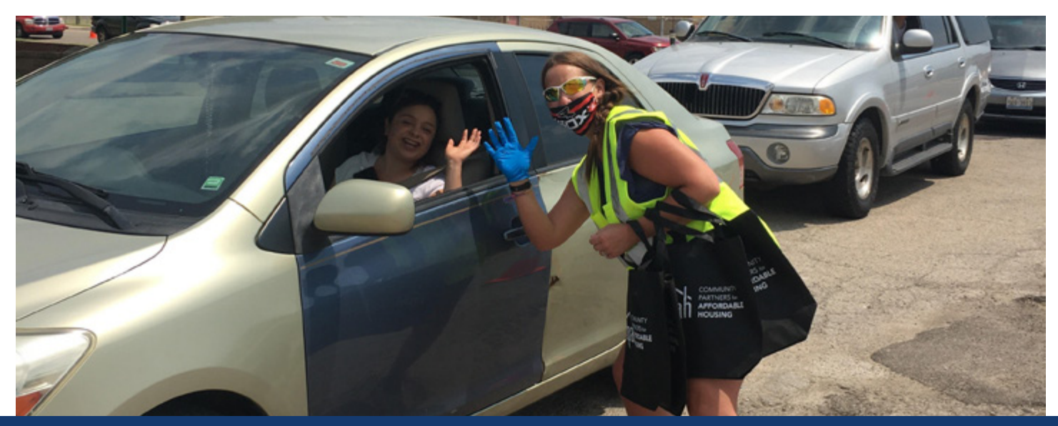
Distributing information about CPAH's COVID relief programs!

COVID-19 is a health crisis that is creating a housing crisis. Thousands of tenants and homeowners are approaching an eviction and foreclosure cliff due to lost wages and unexpected medical expenses. From the start of the crisis, CPAH has been a leader - launching new rental assistance programs, teaching online webinars, providing housing counseling, helping with mortgage assistance, and coordinating community resources to keep people safely housed and reduce the spread of the virus.